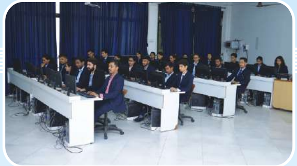
Skills Learning & Wining