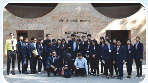
Impeccable IIM Ahmedabad Visit