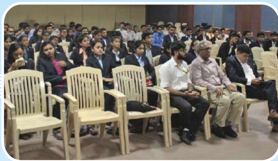
Students for the session