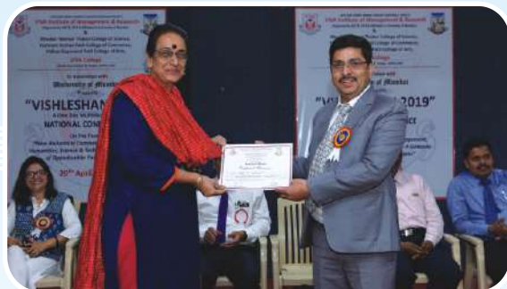
Best Research Paper Award Distribution