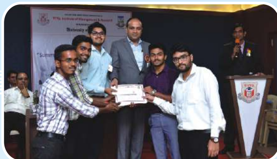
Appreciating the Winners