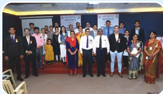
VISHLESHAN 2019 Team -with Winners