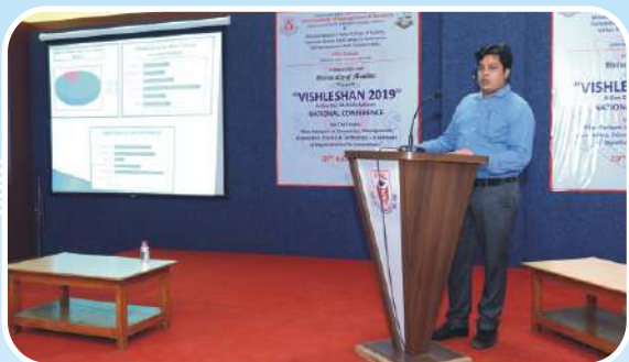
Researchers sharing knowledge

The event had more than 250 participants with contribution of 190 Research papers and leading to 80 participants for paper presentation. The post-lunch session comprised of the presentations from professors and students of different Institutes on various topics. And after the presentation The Best Research Paper Award was announced, followed by distribution of certificates and journals.