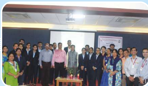
Brief look of Event