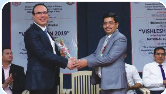
Felicitation of guest