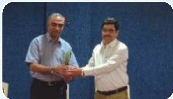
Commending the Guest