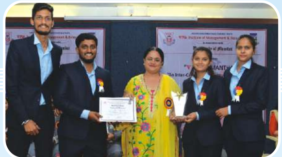
Complementing the Winners