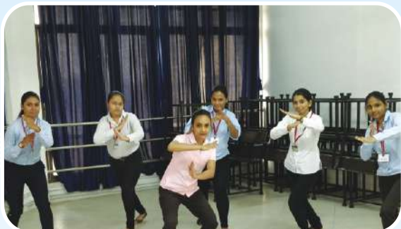
Health Mind remains in healthy body