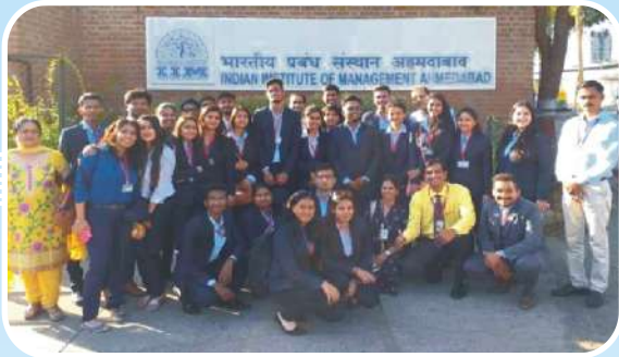
Visit to IIM Ahmedabad

First year and Second year students of MMS visited various companies situated at many places in Gujrat. The Companies visited at these places were GVK Emergency Response Center, Indian Institute of Management - Ahmedabad.