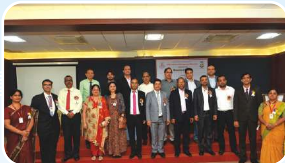
Glance of Event