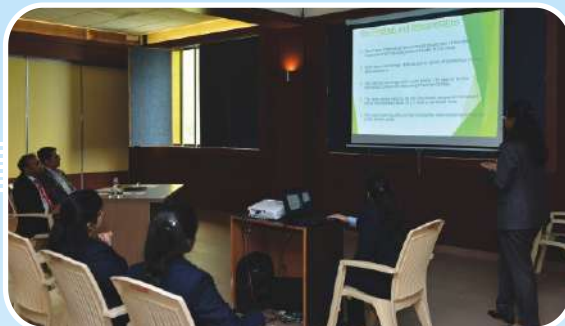
Active Participants Efforts