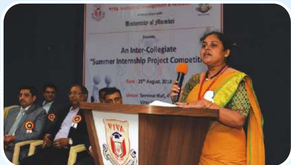
Words of Gratitude