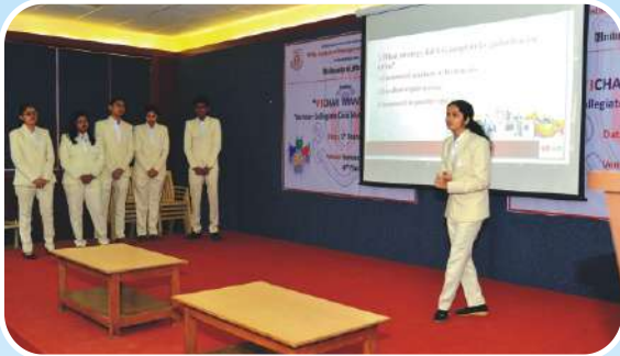
Presenting the case