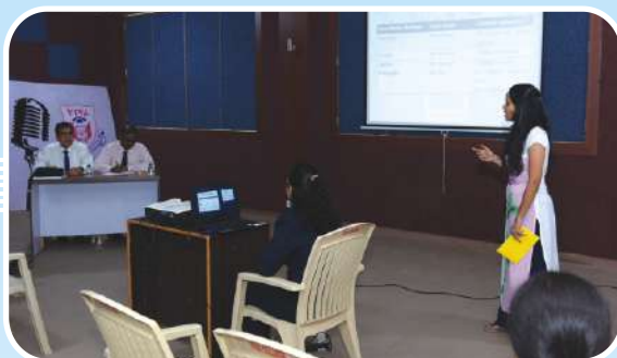
Contributing to research world