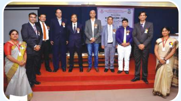
A Full Glance @ HR Conclave