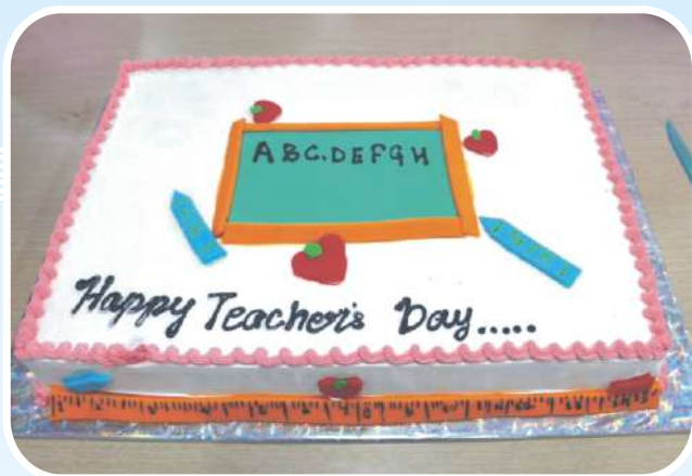
Teacher's Day - VIVA IMR

"A good teacher is Like a candle, It consumes itself to Light the way For others."