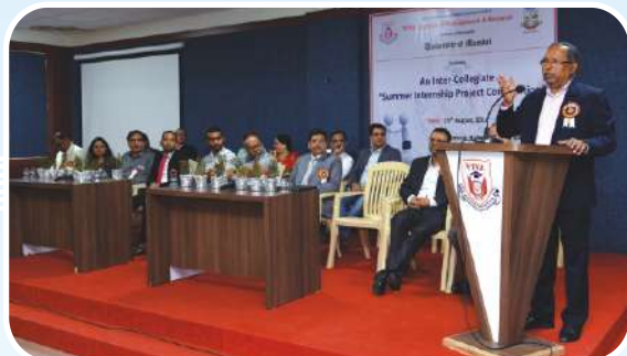
Few Energizing Words