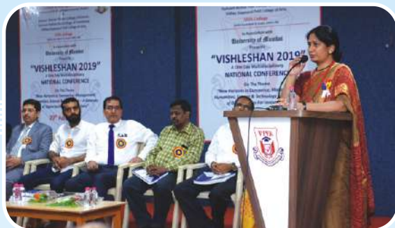
Best Research Paper Award Distribution Ceremony