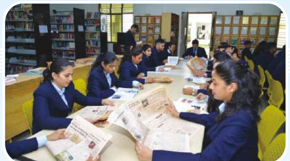
Knowledge is weapon