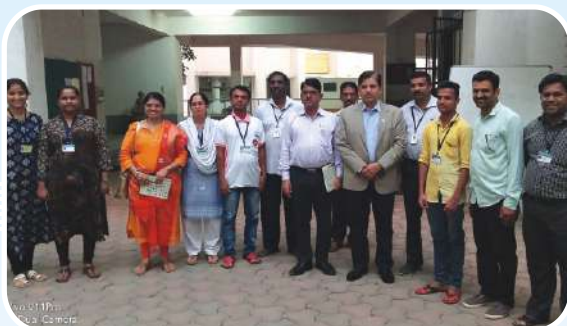
Sneak a Look