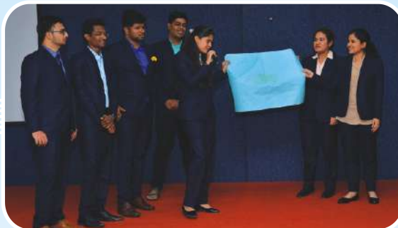
Project Competition -Advertisement