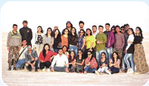
Great White Desert (Rann of Kutch)