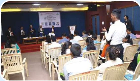
Q & A Session