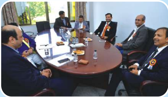
Welcoming the Guests

VIVA Institute of Management and Research in association with University of Mumbai had organized an Inter-Collegiate HR Conclave on the theme Culture, Creativity and Performance on 13th October 2018. More than 200 students participated from different Management Institutes and Under Graduate Colleges across Mumbai.