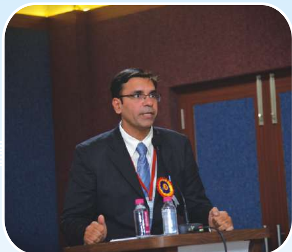
Event In-charge - Giving Vote of Thanks