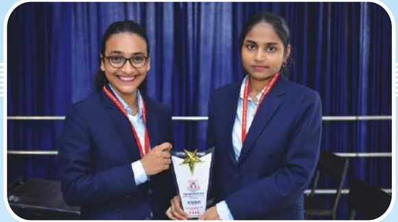
Winners of case Study Competition - Vichar Manthan