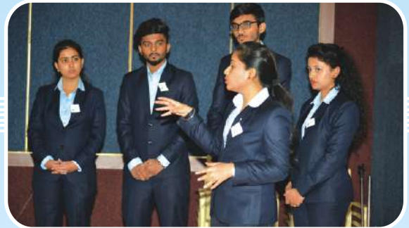
Active Participation & Teamwork