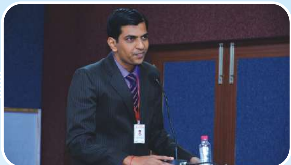
Inaugurating the session