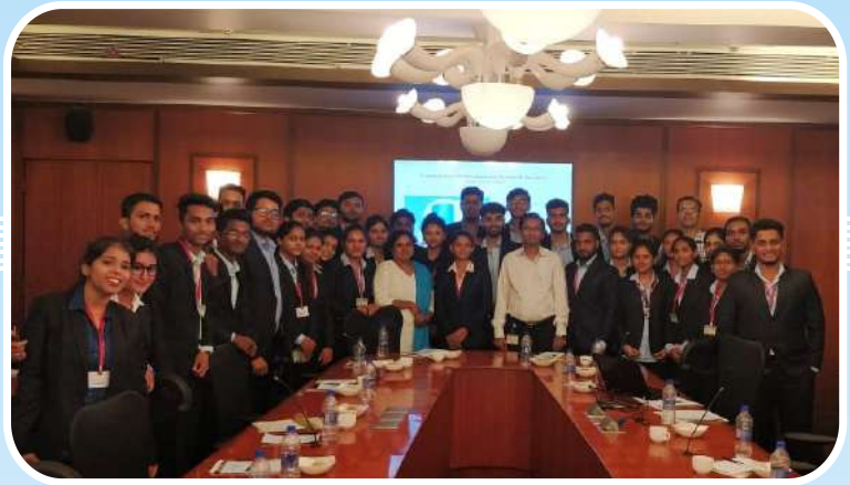
Glimpses of SEBI Study Visit

FYMMS & SYMMS Students visited to SEBI situated at Bandra Kurla Complex in Mumbai and had very enriching experience as well as learning about the regulations of security market.