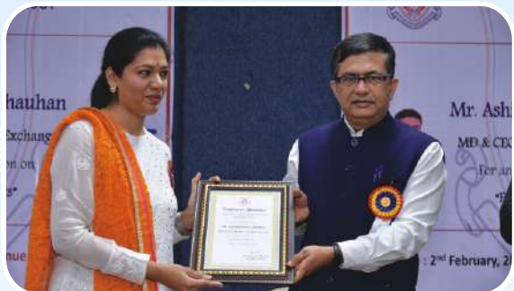
Acknowledging the Guest