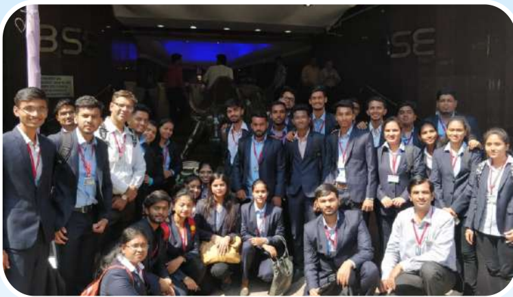
SNEAK A PEEK @ BSE

FYMMS & SYMMS Batches visited Bombay Stock Exchange and acquired valuable practical knowledge related to Stock Exchange located at Dalal Street Mumbai which is the world's fastest stock exchange.