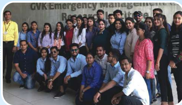
GVK Emergency Management & Research Institute