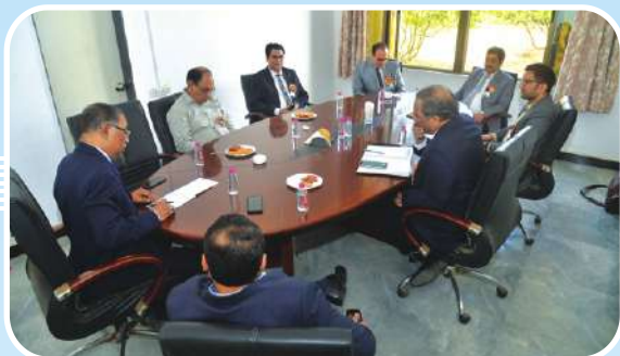
Welcoming the Guests in the Boardroom

VIVA Institute of Management and Research in association with University of Mumbai had organized an Inter-Collegiate Finance Conclave on the theme, Impact of Latest Financial Developments on the Economy and Career on 12th January 2019.