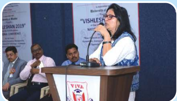
Few words of wisdom