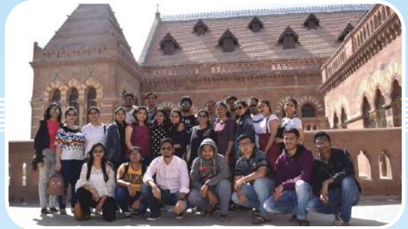
Joyful visit - Prag Mahal