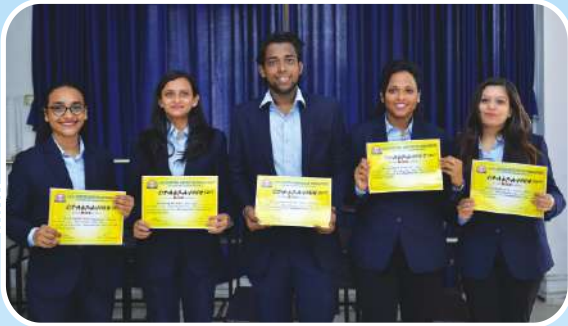
Winners of Intercollegiate Competition