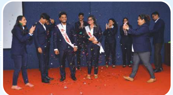
Mr. and Miss Fresher Celebration