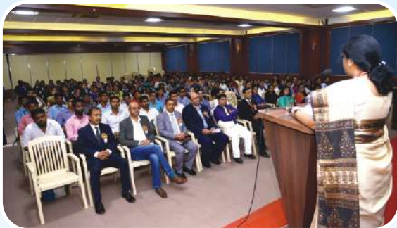
Vote of Thanks