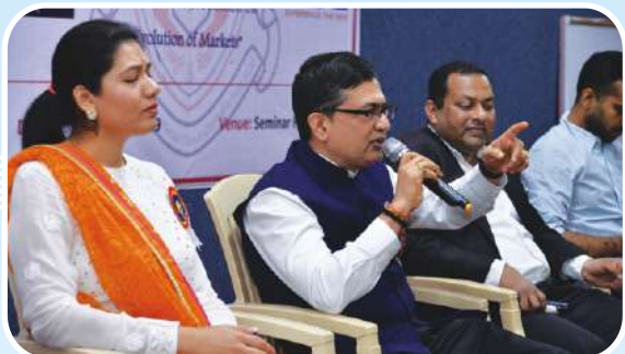
Addressing the student