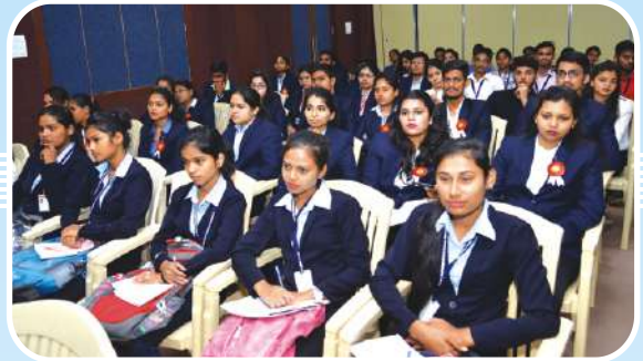
Audience for the Session