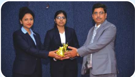
Applauding the winner