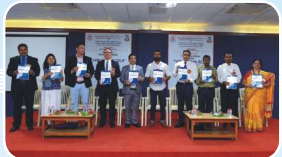
Inauguration of Journal - Vishleshan 2019