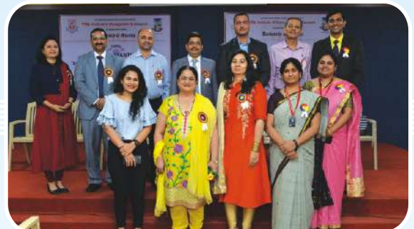
Glance of the Event - Vichar Manthan