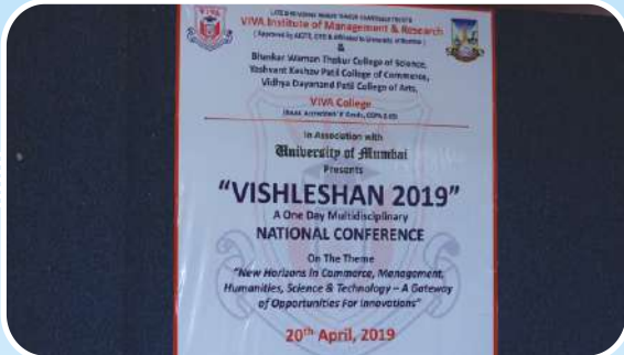
Welcome - VISHLESHAN 2019

We organized second, One Day Multi Disciplinary National Research Conference VISHLESHAN 2019 with the theme 'New horizons in Commerce, Management, Humanities, Science and Technology A gateway to new opportunities and Innovations' jointly organized with VIVA college of Arts, Science and Commerce and in association with University of Mumbai on Saturday, 20th April 2019 with a great success.