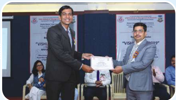
Best Research Paper Award Distribution