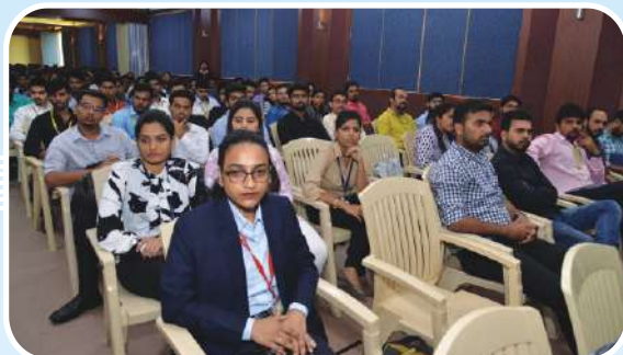
Audience at a Glance