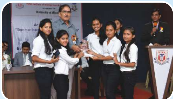
Award winning Team