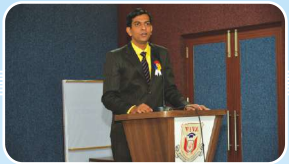
Welcoming the session - Event in-charge