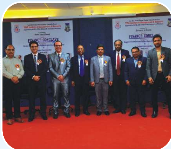
A flash of the Event