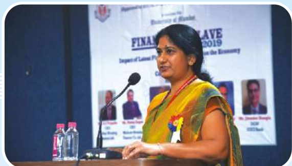
Welcoming the Session