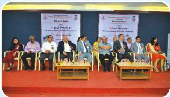
Eminent Guests for the session