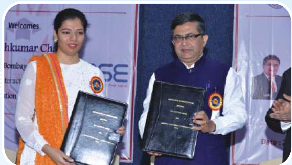
VIVA Trust and BSE - Exchange of MOU's