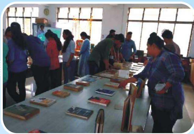
Best Selling Books of well-known author