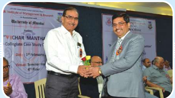
Felicitating the Guests