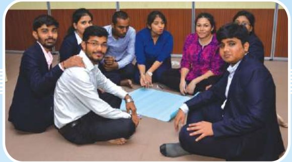
Business Ideas -Having fun