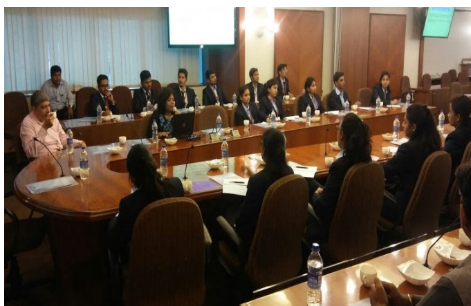
Financial Education For students