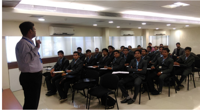
BSE Visit - Addressing the students

FYMMS( 2017-19) & SYMMS(1016-18) Batches visited Bombay Stock exchange & acquired Valuable knowledge related to Stock Exchange located at Dalal Street Mumbai which is the world's fastest stock exchange.