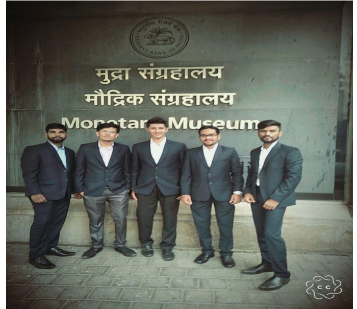
To Understand the Chronology of Coins & Currency