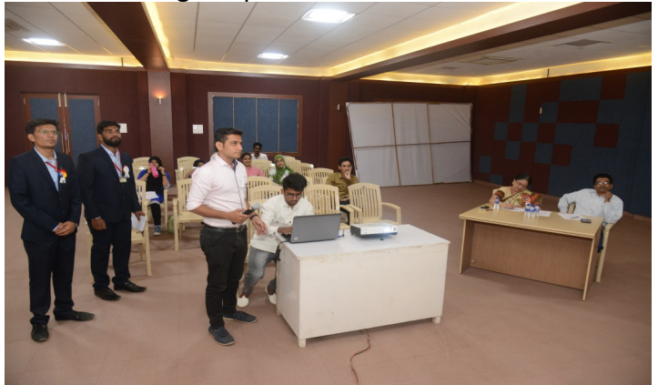
Active Participation & Teamwork