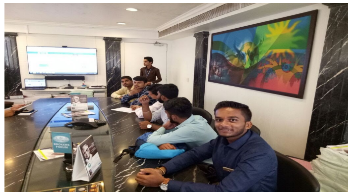
Learning Basic of stock markets