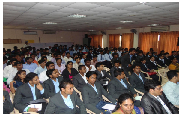
Participants of Financial Analysis