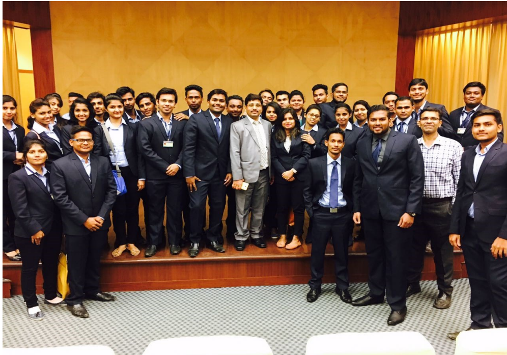
SNEAK A PEAK @ NSE

Students of SYMMS ( 2016-18) learnt the practical knowledge of it fully automated screen-based electronic trading system which offered easy trading facility to the investors spread at the National Stock Exchange of India Limited (NSE) which is the leading stock exchange of India, located in Mumbai .