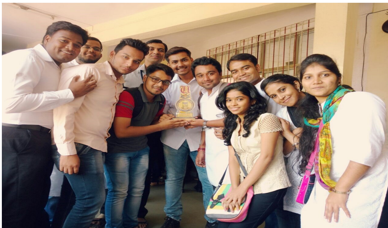
Delighted after a Winning Streak