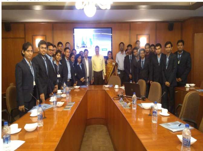
Glimpses of SEBI study Visit

FYMMMS (2017-19) & SYMMMS (2016-2018) Study visit @ SEBI which was very enriching experience as well as learning about the governing regulations of capital market by SEBI. Learning session were conducted on “Takeover Regulation” & “How to Read Offer Document”.