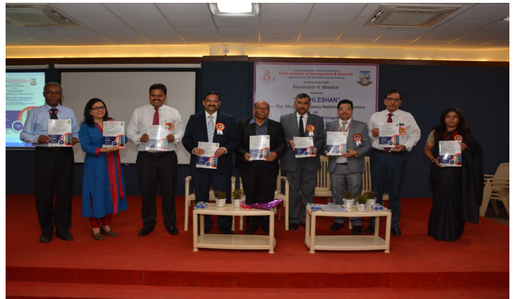
Inaugurating the Journal