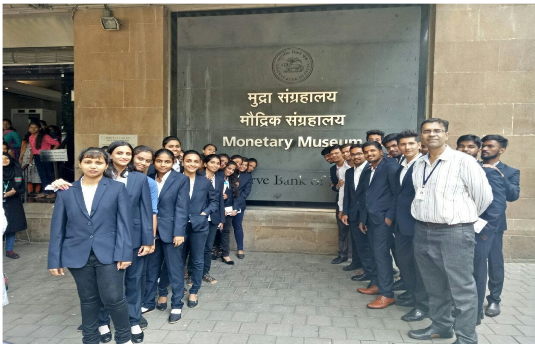
WE....Students and Faculties