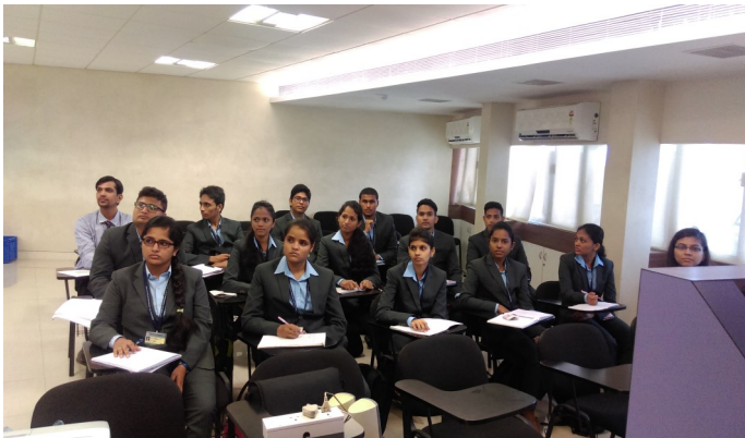
Taking the valuable inputs