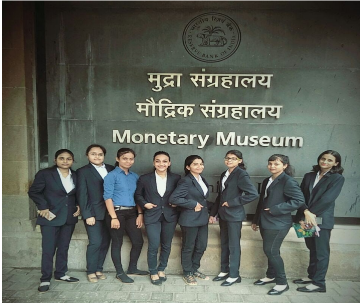
Educational Program at Monetary Museum-RBI

Batch (2017-19) visited RBI Monetary Museum situated at Kala Ghoda, Fort and gain the insights of Chronological Monetary system of India.