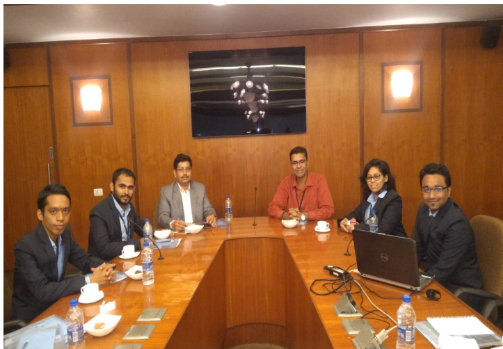
Wisdom with Sophistication