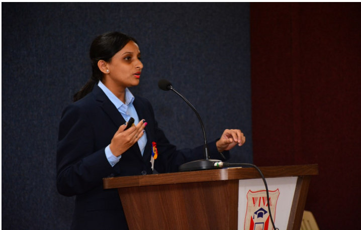
Participants Presenting the Paper