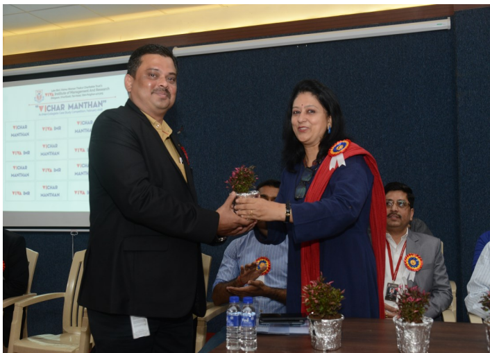
Felicitating the Guests