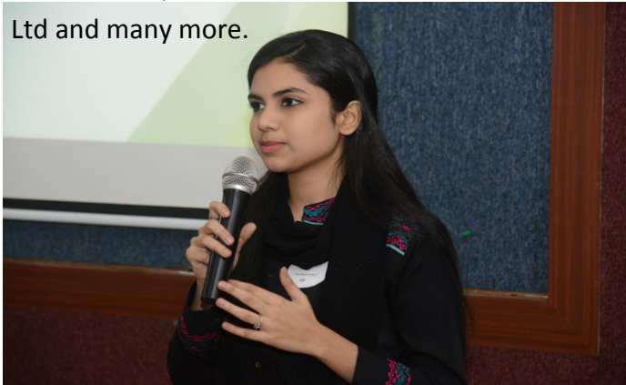
Presenting the Case