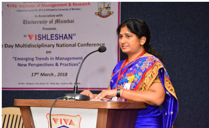
Welcoming the Session—Convenor