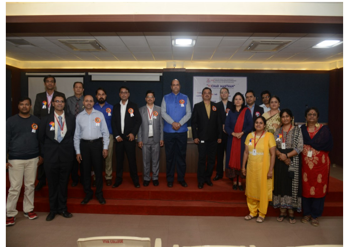
A Full Glance @ VICHAR MANTHAN