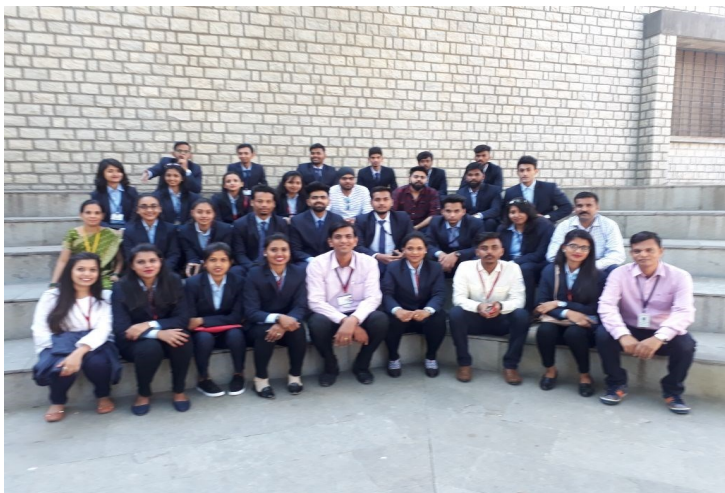
Impeccable IIM Bangalore visit