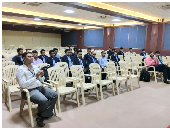
Audience for the session