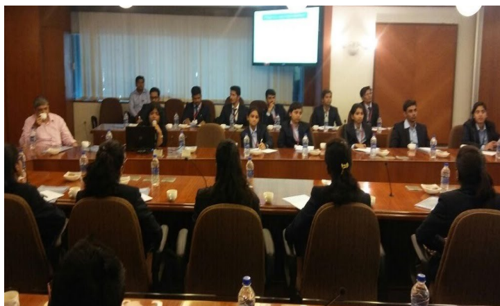
Sharing of valuable information