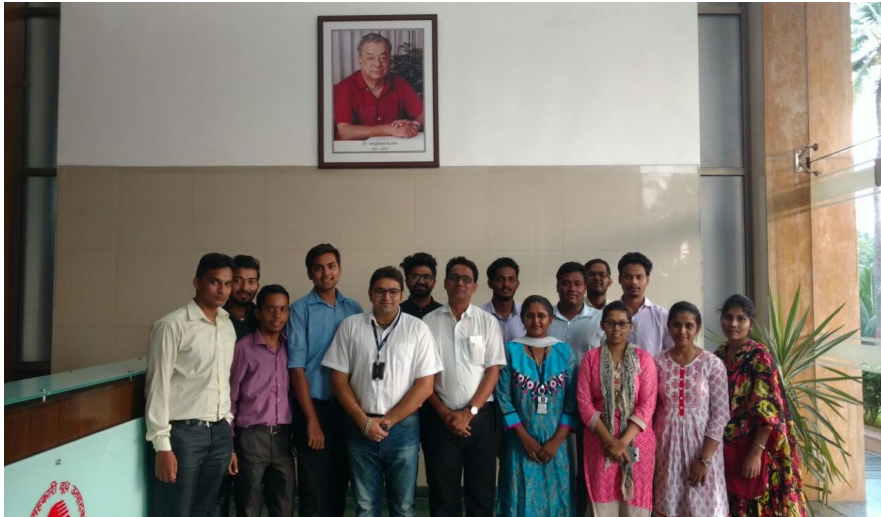
An Amusing visit @ AMUL

First Year and Second year students visited various companies situated at many places like Udaipur /Jodhpur / Bangalore. Companies visited are Amul Cooperative Society, Indian Institute of Management- Bangalore, KSIC Silk Weaving Factory– Mysore etc.