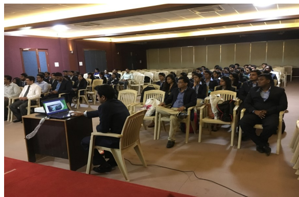
Audience for the session