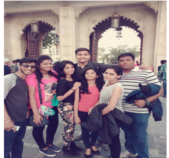
Joyful visit @ JODHPUR