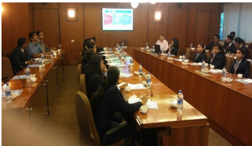
Learning SEBI's Role as a regulator of capital market