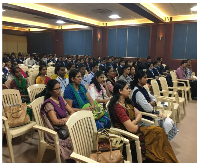
Participants of session