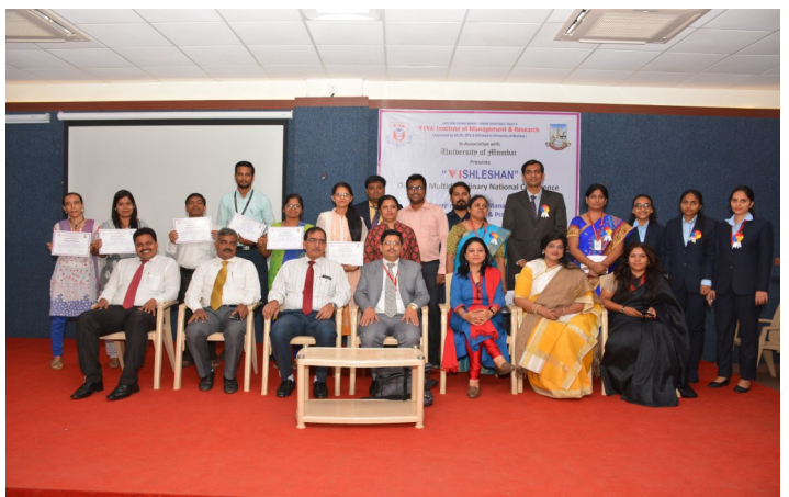
Full Glance at VISHLESHAN