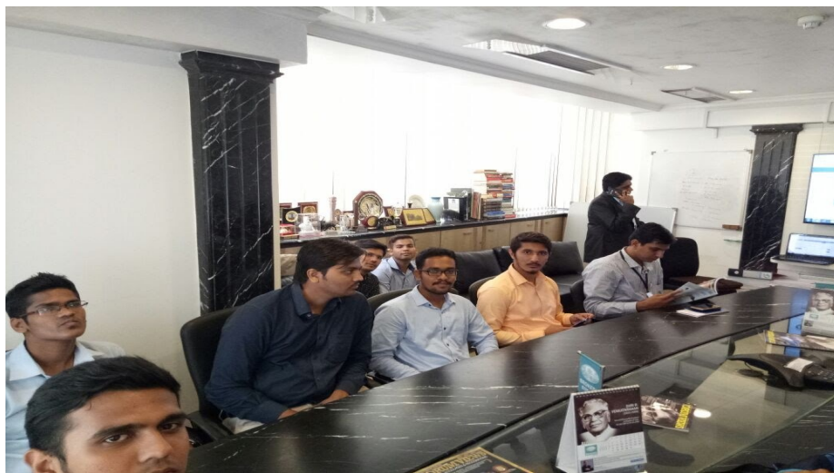
Inputs for Trading hard earned MONEY