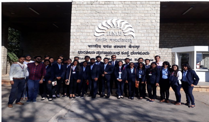
Visit at IIM Bangalore