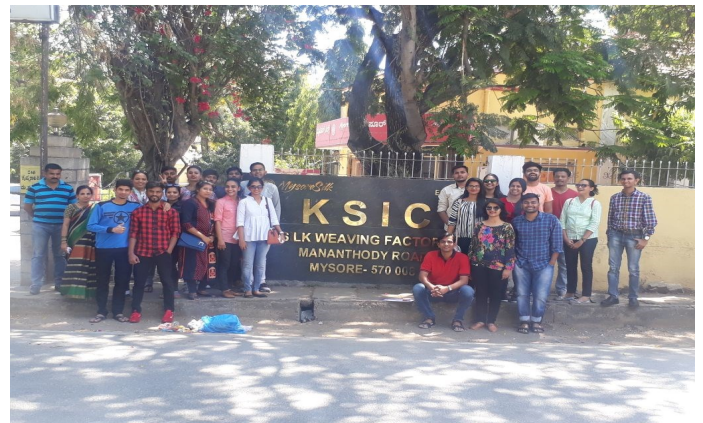
KSIC Silk Weaving Factory- Mysore