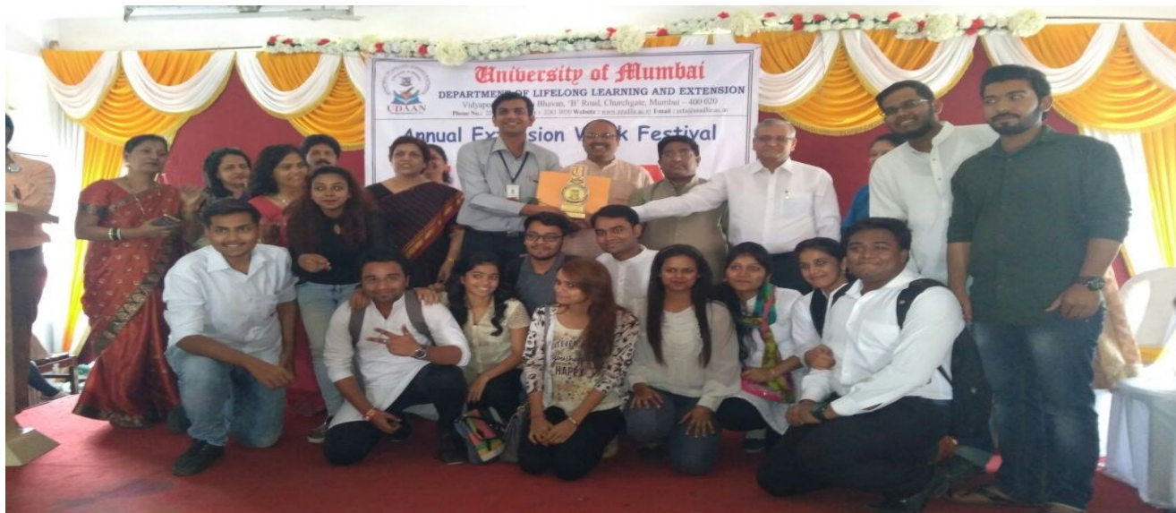
Felicitation by Chief Guest

FYMMS batch 2016-2018, secured 1st Place at DLLE Annual Extension Work Festival in STREET PLAY COMPETITION organized by University of Mumbai, held at G. G. College., Vasai.