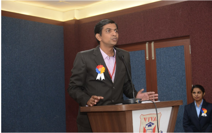
Welcoming the session—Event In charge

Vichar Manthan, An Intercollegiate case study Competition in major domains like Marketing, Finance and HR. was organized on 10th Feb 2018. more than 18 management Institute and degree colleges across Mumbai had participated and more than 150 students visited the campus