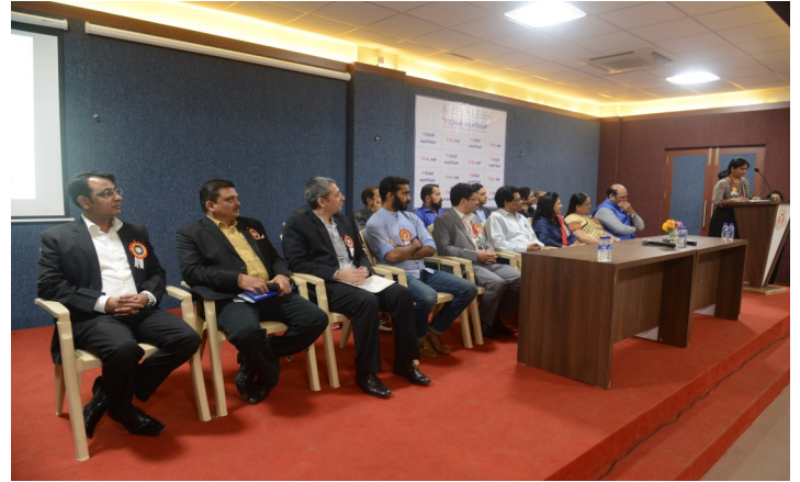
Inaugurating the Session—VICHAR MANTHAN