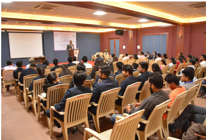
Audience @ Vishleshan